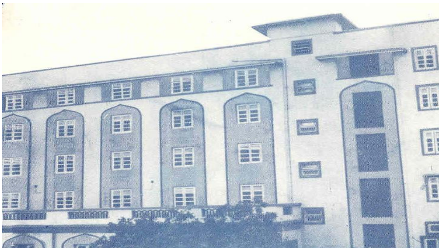
Jaffer Sulimani Guest house at Wadi bander Mumbai

13. In a recent visit to Mumbai, Chairman Human Aid Society visited Tata Cancer Institute Mumbai India. Since Mumbai is a metropolis, so the patients of our state have to face the brunt by paying huge amounts as medical expenses and in addition to that the attendants staying in guest houses have also to pay huge amounts as rent. Chairman Human Aid Society had a meeting with the owner of the Jaffer Suleiman guest house ; a big guest house near the Tata Cancer institute and convinced him to extend some special offers to the attendants of J&K state patients. Fortunately, the request was approved and the owner promised to give a rebate of 50% on room rent to the attendants of J&K state patients. Moreover, Human Aid Society intends to open a Blood Bank counter at Tata Cancer Institute Mumbai so that patients who need blood will not suffer. Human Aid Society Kashmir has already initiated this process and expects different corners to help in this noble cause