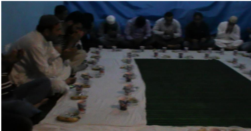
Photo of Iftar Party organized by Human Aid Society

15. Human Aid Society organizes Iftar Parties during the month of Ramadan with the objective to remind affluent class about their duty towards the downtrodden lot. We at Human Aid Society also organize Eid Milan inviting officers, traders and other respectable citizens in addition to our wards. It aims at awakening the society about the miserable conditions of those wards and at the same time these wards get encouragement during their stay with those respectable citizens so it is a step forward to bring everybody on the same platform.