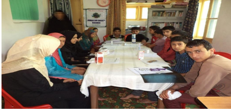
Human Aid Society Sponsors after their Medical Check up.