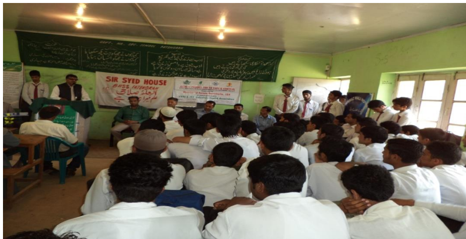
Awareness program about T.B control held at HSS Fatehgad Baramulla.