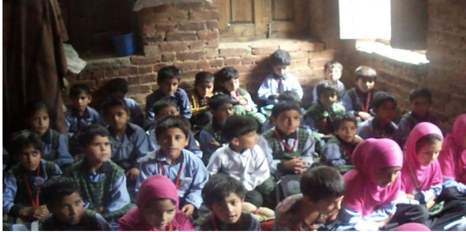
A View of Students reading in a Government School

15. Human Aid Society organizes Iftar Parties during the month of Ramadan with the objective to remind affluent class about their duty towards the downtrodden lot. We at Human Aid Society also organize Eid Milan inviting officers, traders and other respectable citizens in addition to our wards. It aims at awakening the society about the miserable conditions of those wards and at the same time these wards get encouragement during their stay with those respectable citizens so it is a step forward to bring everybody on the same platform.