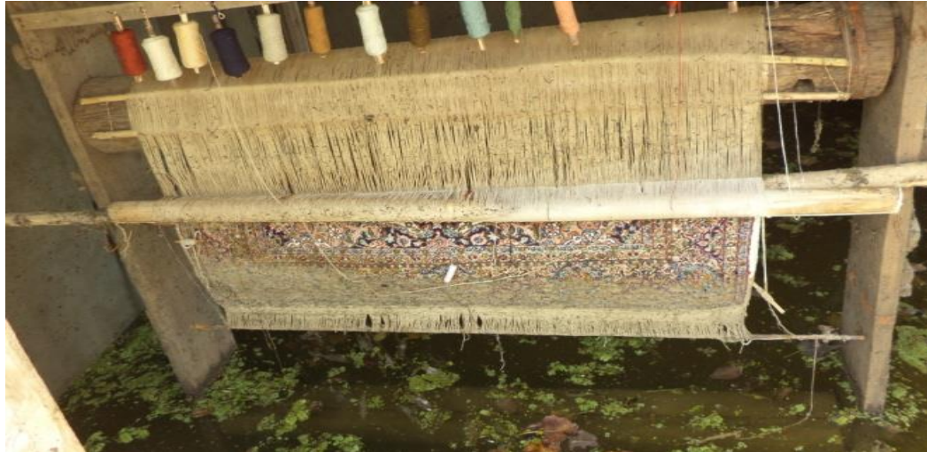
A view of Carpet viewing loom under flood water in Village Naidkhay Bandipora.