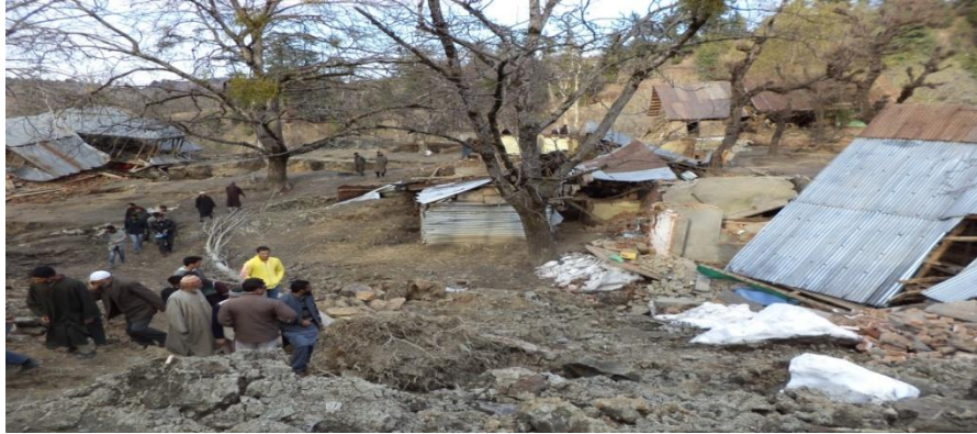
A picture of houses buried by killer landslides in village Laridoora