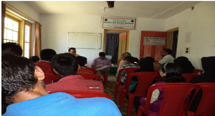
Counseling Class for Human Aid Society Students